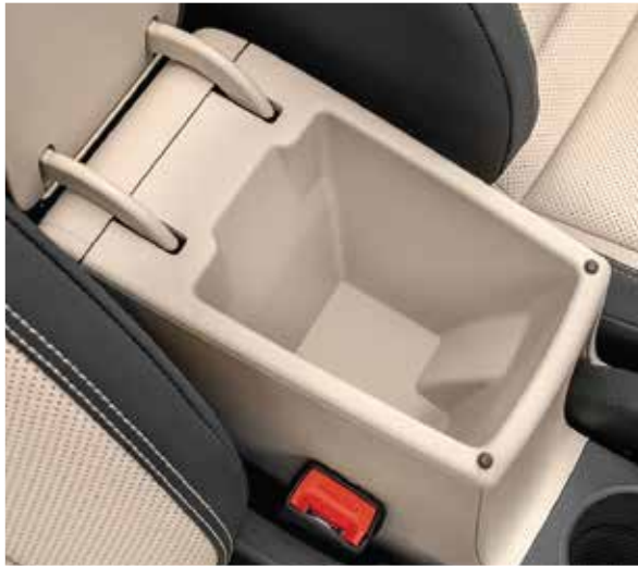
Storage In Front Centre Armrest