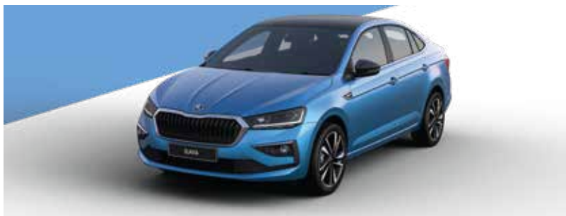
Crystal Blue With Carbon Steel Roof