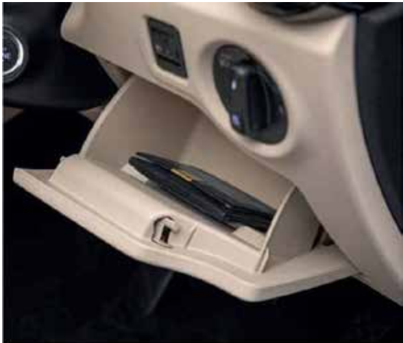
Driver Storage Compartment