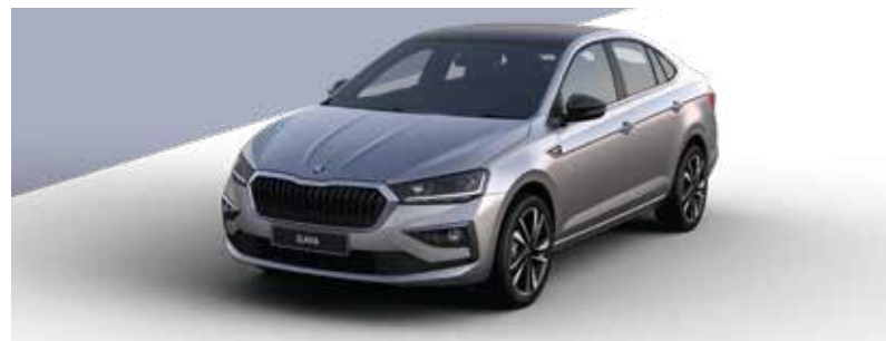
Brilliant Silver With Carbon Steel Roof