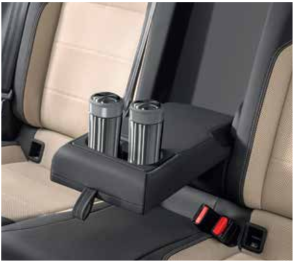
Cupholders In The Armrest