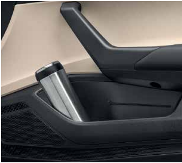
Storage In Front And Rear Doors