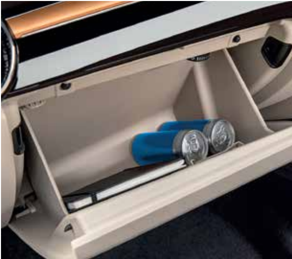
Cooled Glove Box