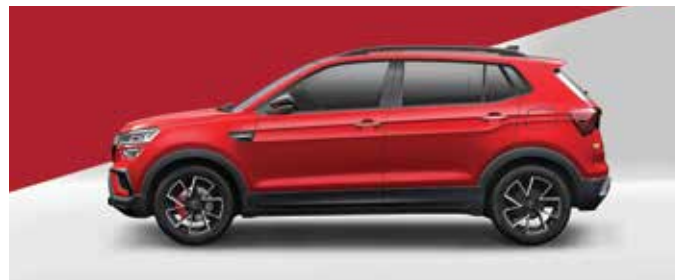
Monte Carlo - Tornado Red with Carbon Steel Painted Roof