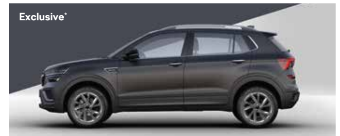
Kushaq Matte Edition