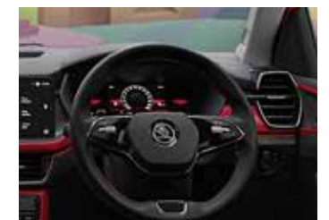
20.32cm Škoda Virtual Cockpit with Red Theme