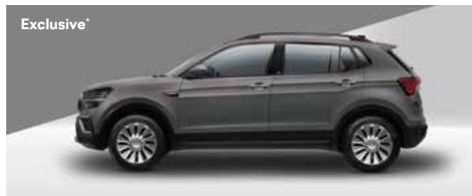
Kushaq Onyx - Carbon Steel