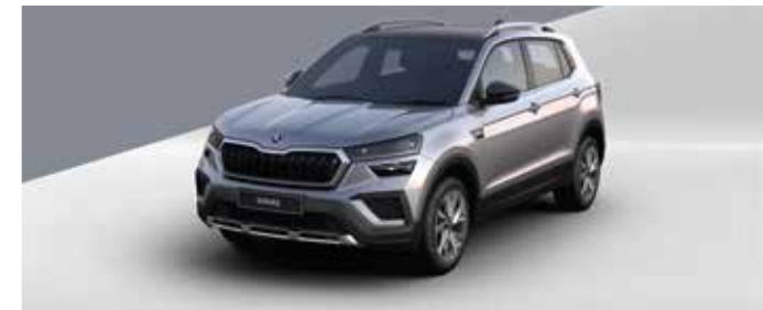
Brilliant Silver With Carbon Steel Roof