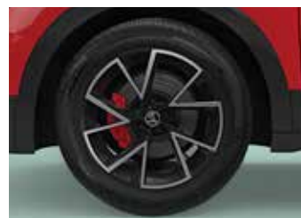
R17 Dual-tone Vega Alloy Wheels With Red Brake Calipers*