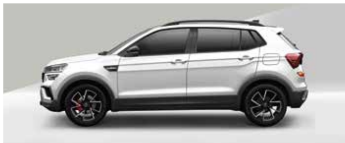
Monte Carlo - Candy White with Carbon Steel Painted Roof