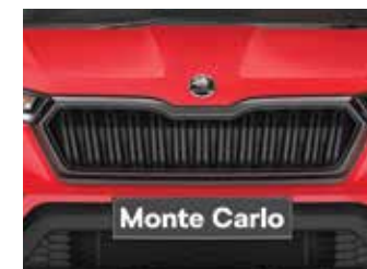
Škoda Signature Grille With Glossy Black Surround