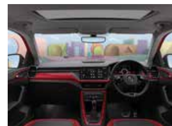
Red Ambient Lighting with Ruby Red Metallic Décor