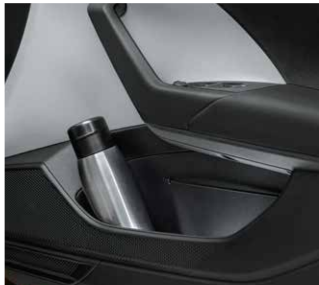
Storage In the Front and Rear Doors