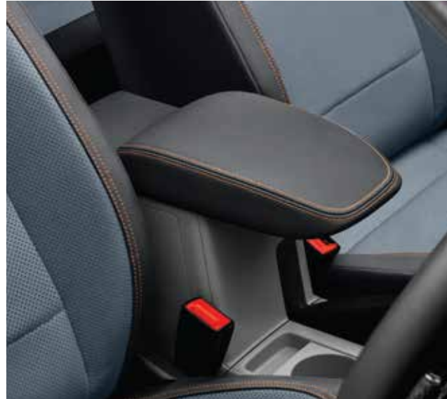
Storage In Front Centre Armrest