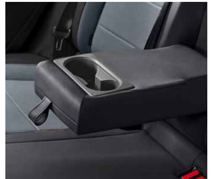
Cupholders In Armrest