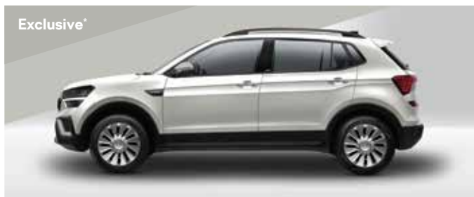
Kushaq Onyx - Candy White