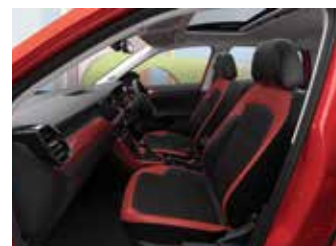
Monte Carlo Inscribed Ventilated Red & Black Front Leather Seats