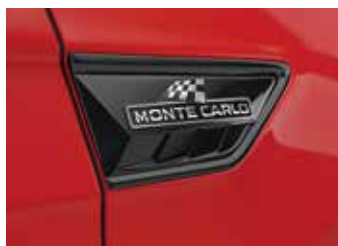
Monte Carlo Fender Garnish