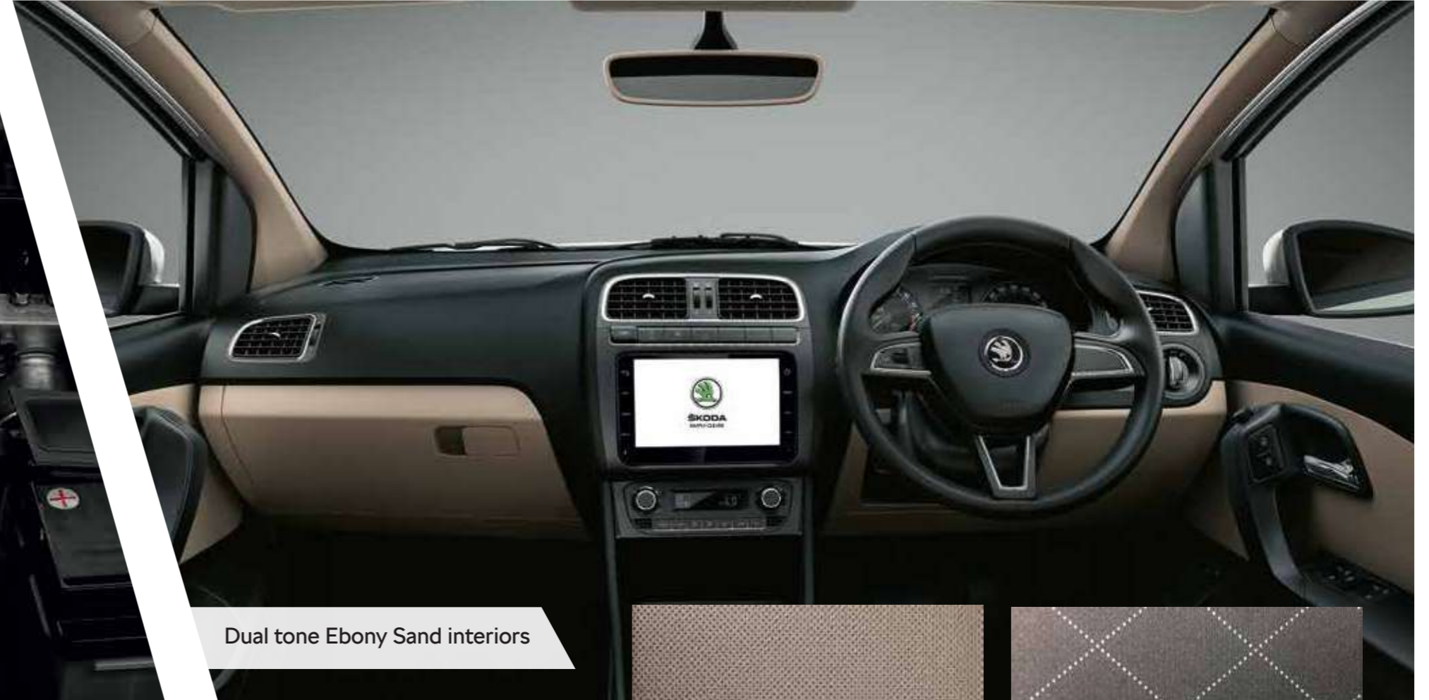
Dual tone Ebony Sand interiors