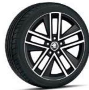
Dual tone Clubber, alloy wheels