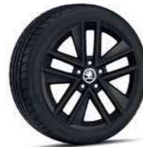
Glossy black Clubber, alloy wheels