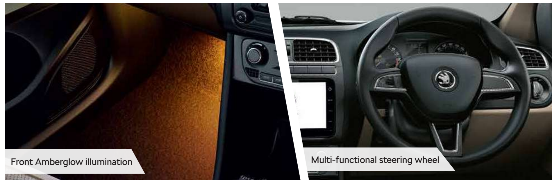
Front Amberglow illumination