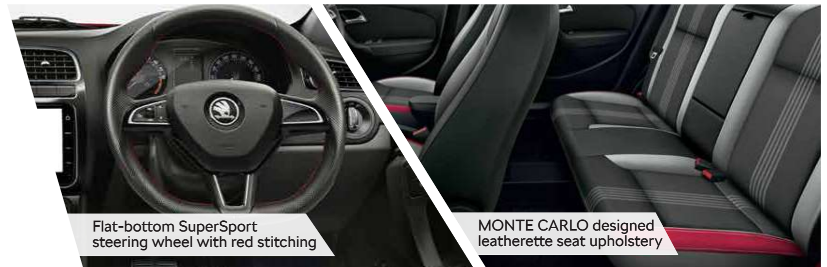
Flat-bottom SuperSport steering wheel with red stitching