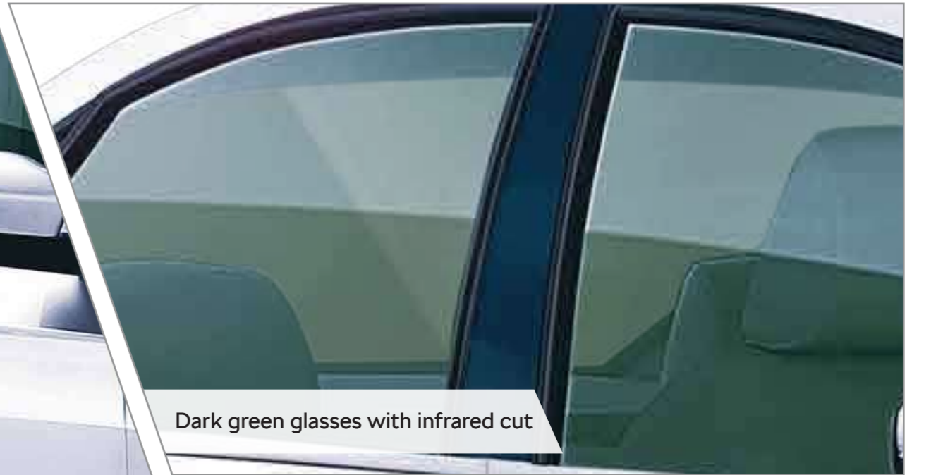
Dark green glasses with infrared cut