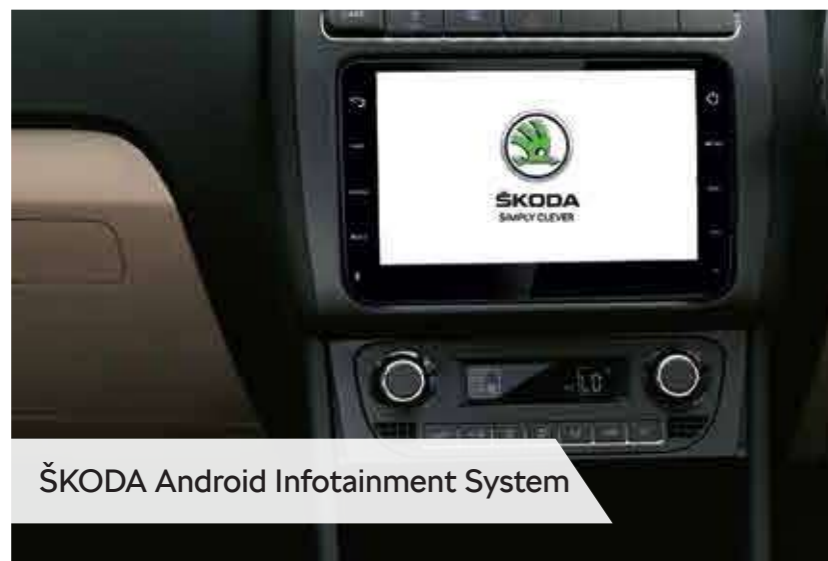
ŠKODA Android Infotainment System