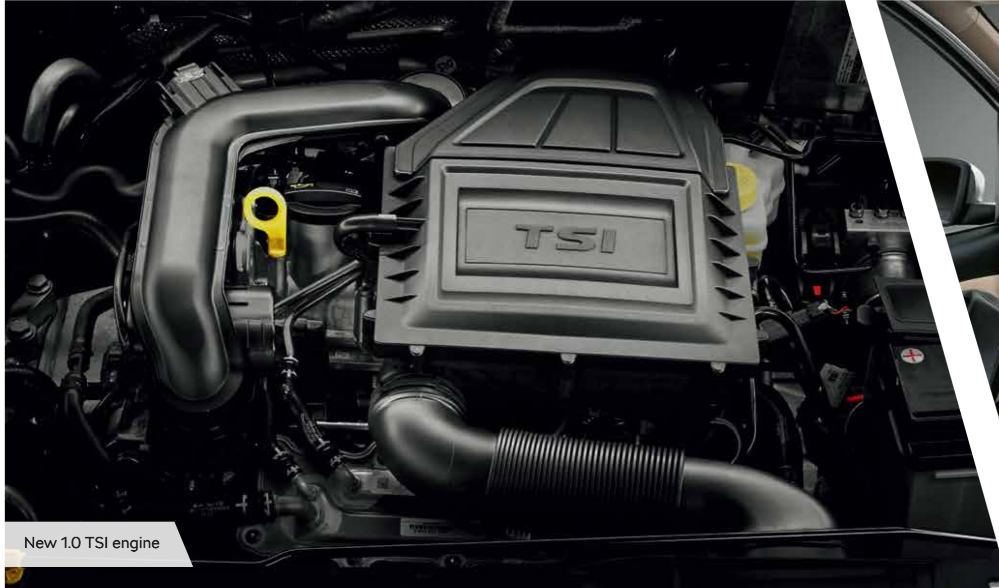
New 1.0 TSI engine