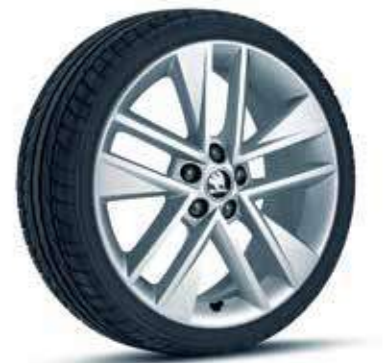
Clubber, R16 Available in Style variant