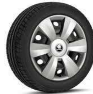
Dentro, R15 Available in Rider & Rider plus variants