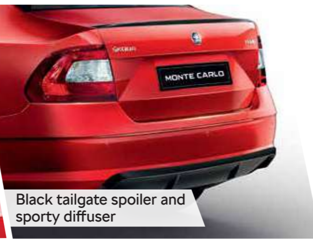
Black tailgate spoiler and sporty diffuser