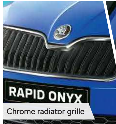
Chrome radiator grille