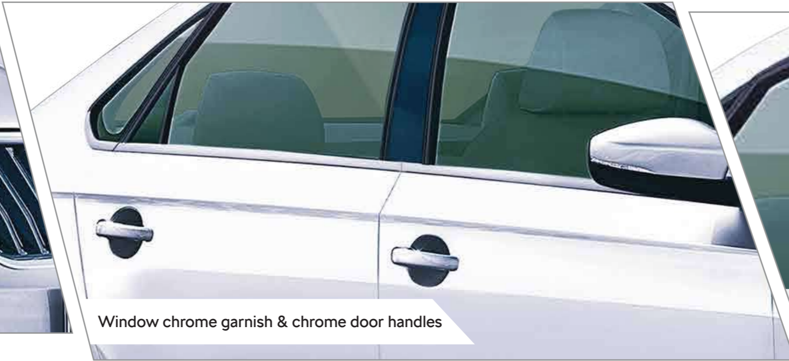
Window chrome garnish & chrome door handles