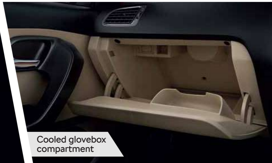
Cooled glovebox compartment