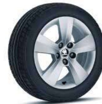
Matone, R15 Available in Ambition variant