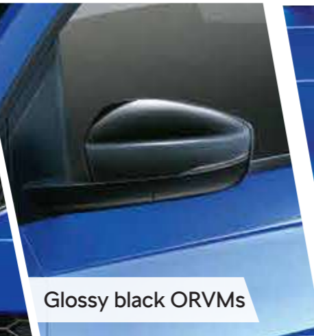
Glossy black ORVMs