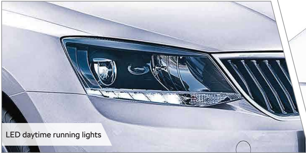
LED daytime running lights