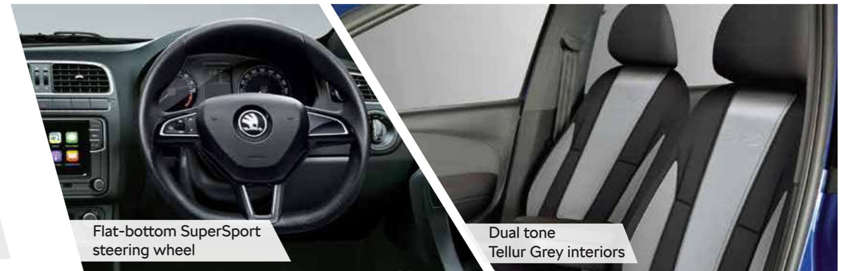
Flat-bottom SuperSport steering wheel