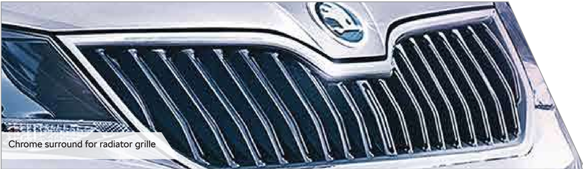
Chrome surround for radiator grille