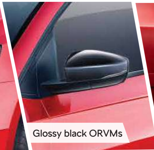
Glossy black ORVMs