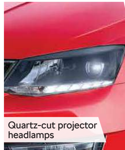
Quartz-cut projector headlamps